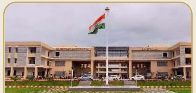
Janagon Collectorate - 5 Mins

"ASSESS THE FUTURE, BUY THE PLOT TODAY TO MAKE YOUR FUTURE SECURED"