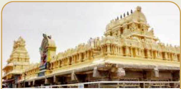
Bhadrakali Temple - 50 Mins