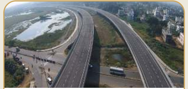
NH 163 - From Venture