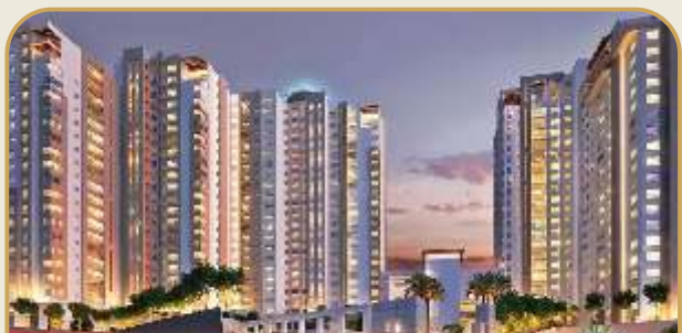
Gachibowli - 100 Mins