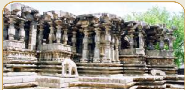
1000 Pillars Temple - 45 Mins