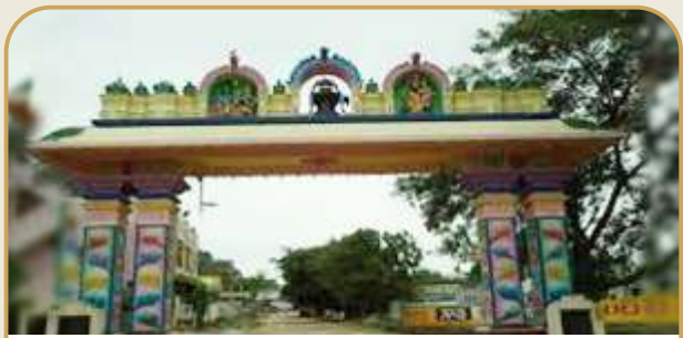
Palakurthy Someshwara Temple - 15 Mins