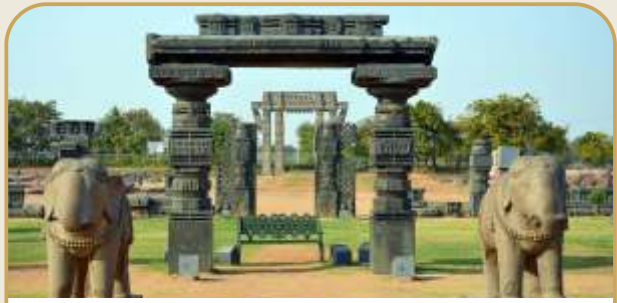
Warangal Fort - 30 Mins