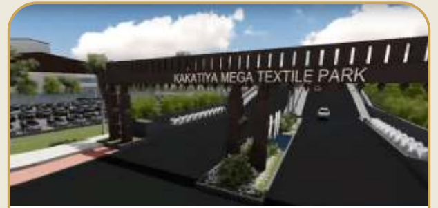
Kakatiya Mega Textile Park - 60 Mins