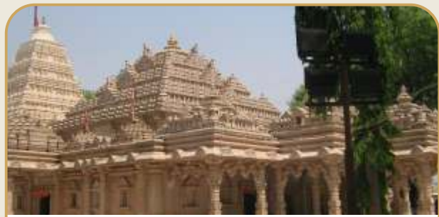
Jain Temple Kolanupaka - 25 Mins