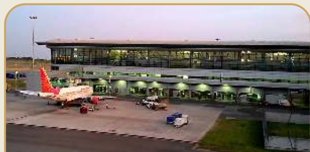
Rajeev Gandhi (I) Airport - 110 Mins

The Project is very proximity to Proposed Regional Ring Road (RRR) which connects Hyderabad - GHMC and Warangal City.