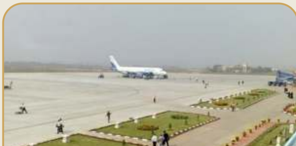
Warangal Airport - 60 Mins