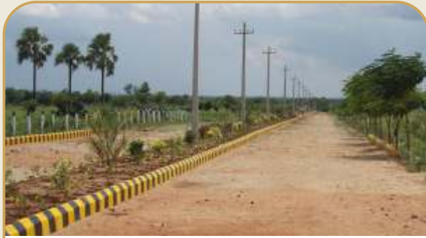
60 Feet Gravel Roads