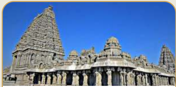
Yadadri Temple - 30 Mins