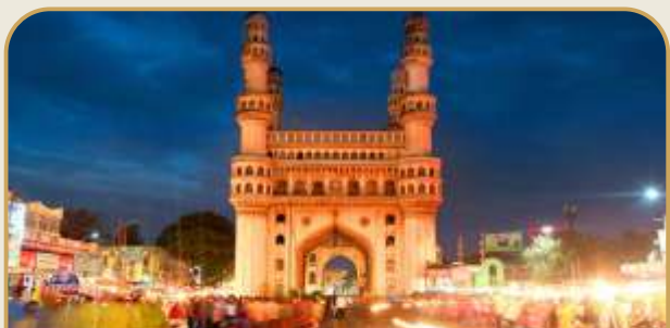
Hyderabad - 90 Mins