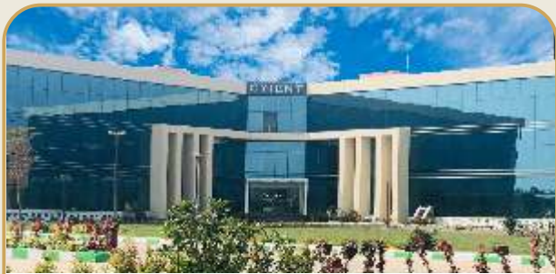
Warangal IT Park - 20 Mins