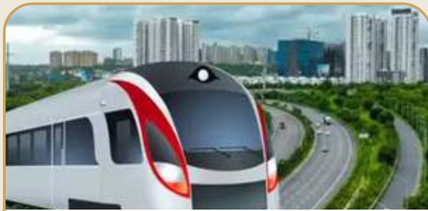
Outer Ring Rail