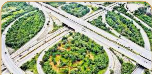
Regional Ring Road - 15 Mins