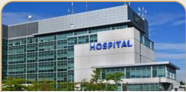
Multi Specialty Hospital