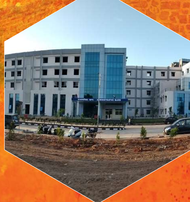
NIMS - Bibinagar