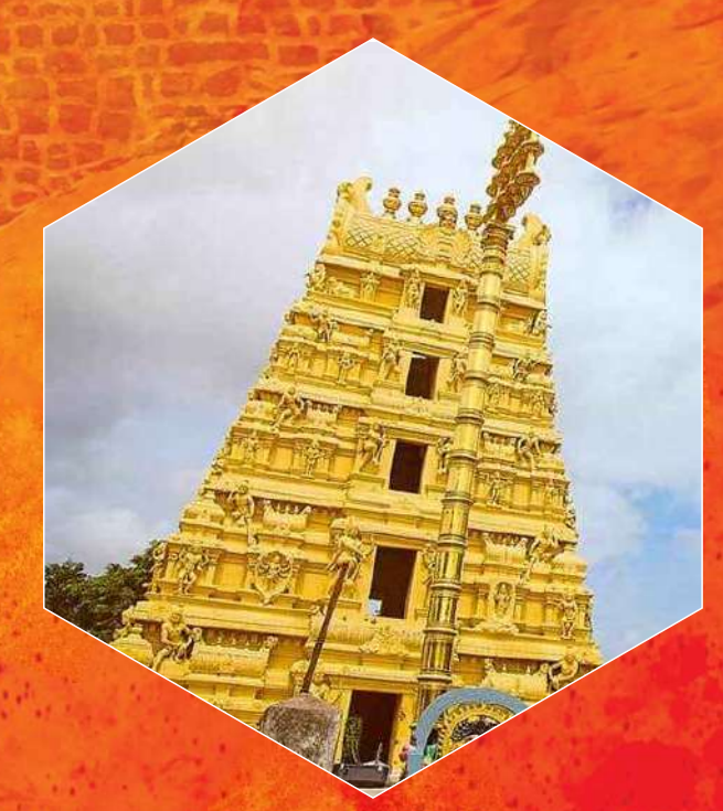
Komaravelli Mallanna Temple